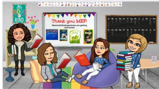
MEF Endowment 1999-2020

Thanks to our generous donors, MEF was able to continue funding our established collaborative programs with District 40 schools, Science Experiences and Artist-in-Residence, as well as teacher mini-grants and Battle of the Books.